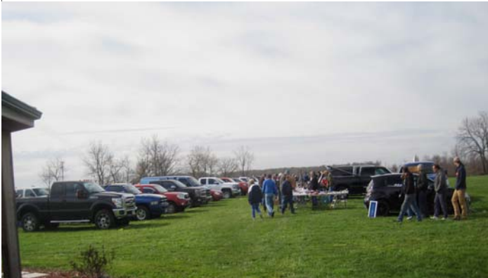
Car Parts Swap Meet at the Farm

The weather was beautiful for our 6th year of hosting the Rods & Customs Car Parts Swap Meet . Vendors for this event keep growing and buyers fill our parking lot and other areas as well. Our food concession group did an excellent job keeping up with customers. We showed a profit of $1332. We also had many visiting our Farm Museum. Great job one and all!